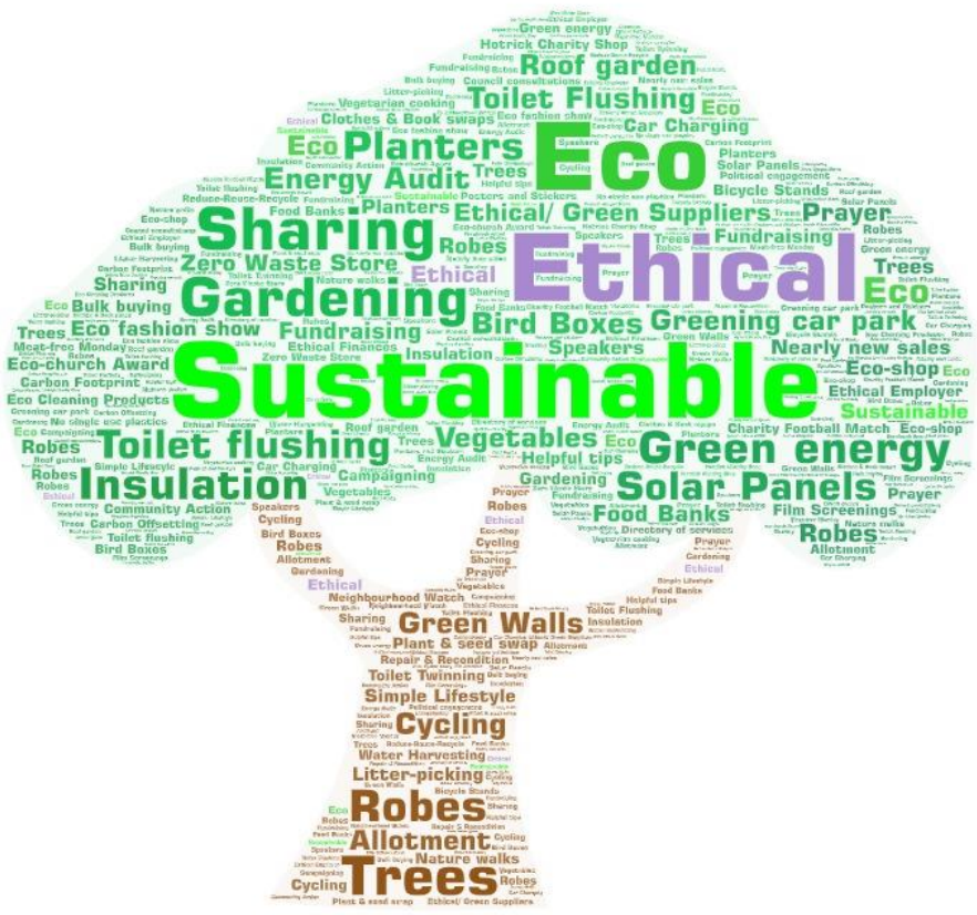
This is a word tree that is composed of the ideas suggested by everyone at Haddon as part of their response to the policy consultation